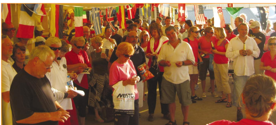
Pink was definitely the colour of the day The above presentation photos by Deanna Smyth