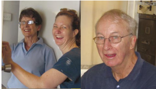
Working Bee 14th March. Next Working Bee 2nd May.